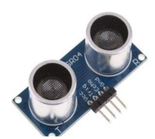
Fig. 3: Ultrasonic Sensor